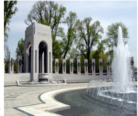
World War II Memorial