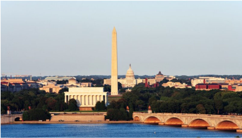
Historic National Buildings